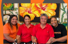
Hosted by your Whanau Engagement Team

Join us as we get fit while we, walk and talk. A casual way to connect with other whanau in our community.