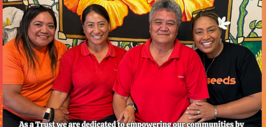
As a Trust we are dedicated to empowering our communities by strengthening families.